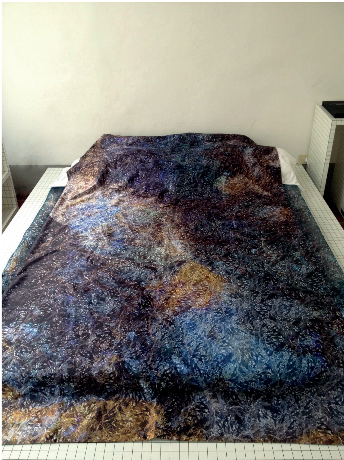
2011- ongoing 5 examples, 210 x 90 cm each retroreflective surface, sublimatic print on setaflag tissue. Installation view: Villa Romana, Florence

The blankets are made of a reflective material (high reflective micro glass beads) upon which is printed a pattern obtained by merging images of a meteorite and those of some crystals. The textile is made employing a digital print sublimation technique, where the transfer of the colour from the printer to the support is carried out using heat transfer. The ink, which is held in polymer form, is heated to a high temperature and impregnates the material through sublimation. The blanket thus become an object which is “de-materialised”: the reflective material makes it into something able to both capture and reflect light, and the pattern itself takes on the “weight” of a projection - it is like a hologram, a spatial-temporal door.