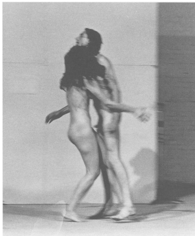
FIG. 1 Marina Abramovic/Ulay, Relation in Space . Performed at Venice Biennale, 1976.

I have been accused on the one hand (by art historians) of not caring enough about “the archive” and artistic