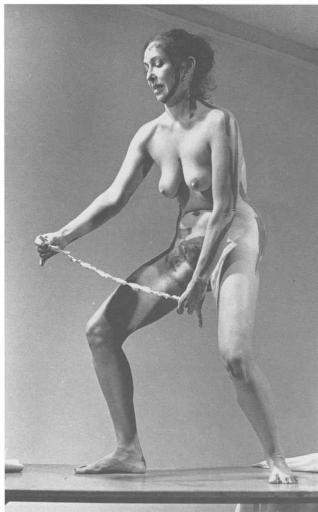
FIG. 2 Carolee Schneemann, Interior Scroll , 1975.

I have already made clear that I specifically reject such conceptions of body art or performance as delivering in an unmediated fashion the body (and implicitly the self) of the artist to the viewer. The art historian Kathy O'Dell has trenchantly argued that, precisely by using their bodies as primary material, body or performance artists highlight the "representational status" of such work rather than confirming its ontological priority. The representational aspects of this work—its "play within the arena of the symbolic" and, I would add, its dependence on documentation to attain symbolic status within the realm of culture—expose the impossibility of attaining full knowledge of the self