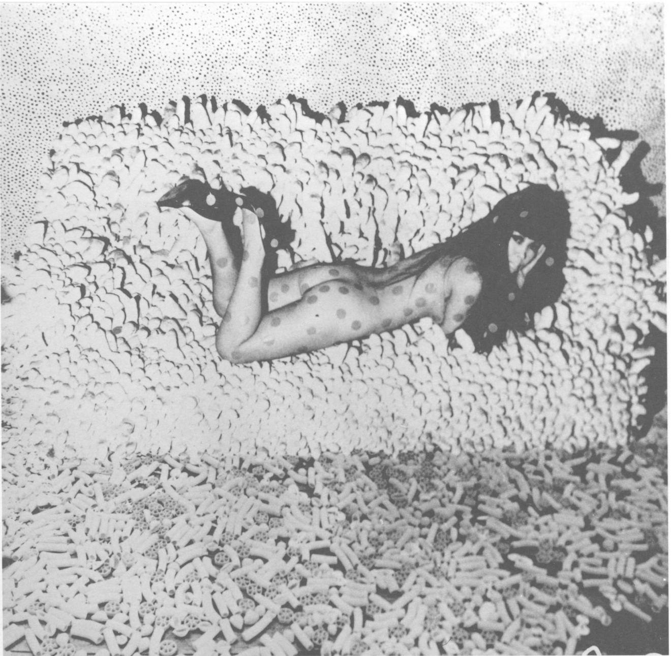
FIG. 3 Yayoi Kusama, Self-Portrait , 1962.

polka-dotted wall (her installation Mirror Room and Self-Obliteration). Now, her pose and garb remove her from us, camouflage shifting her into the realm of potential invisibility ("self-obliviation"). She still can't decide whether she wants to proclaim herself as celebrity or pin-up (object of our desires) or artist (master of intentionality). Either way, her "performance" takes place as representation (pace Warhol, she's on to the role of documentation in securing the position of the artist as beloved object of the art world's desires); she comprehends the "rhetoric of the pose" and its specific resonance for women and people of color. The pictures of Kusama are deeply embedded in the discursive structure of ideas informing her work that is her "author-function." 20